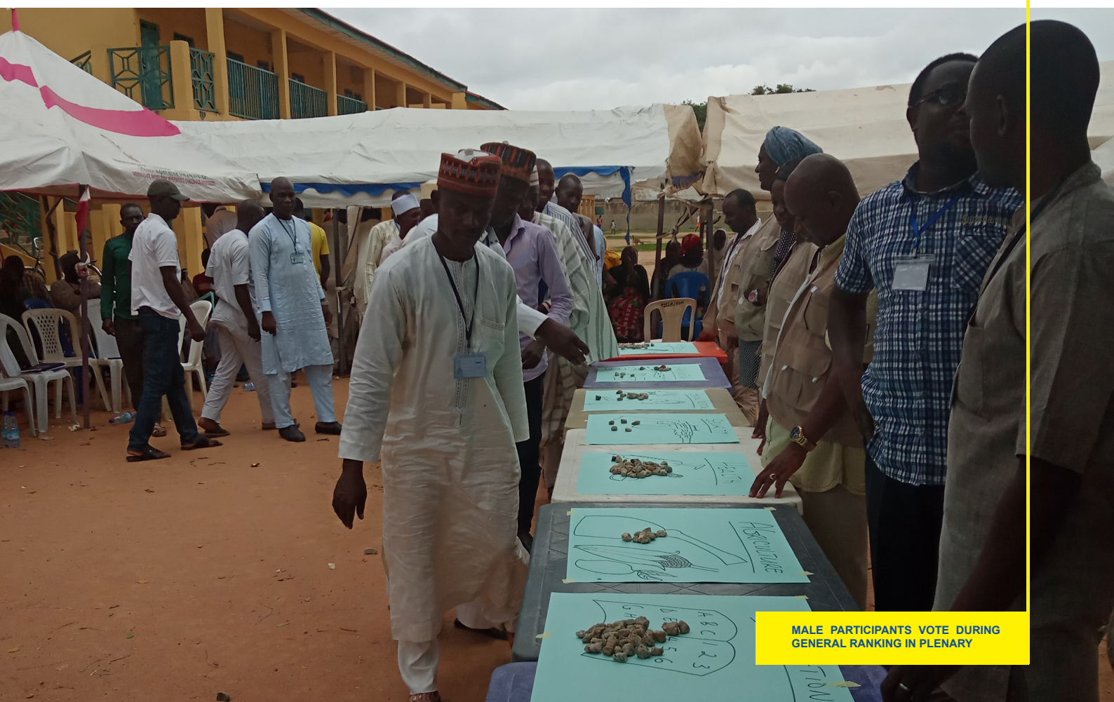
MALE PARTICIPANTS VOTE DURING GENERAL RANKING IN PLENARY

In the tables below, you will find a summary of our discussions: