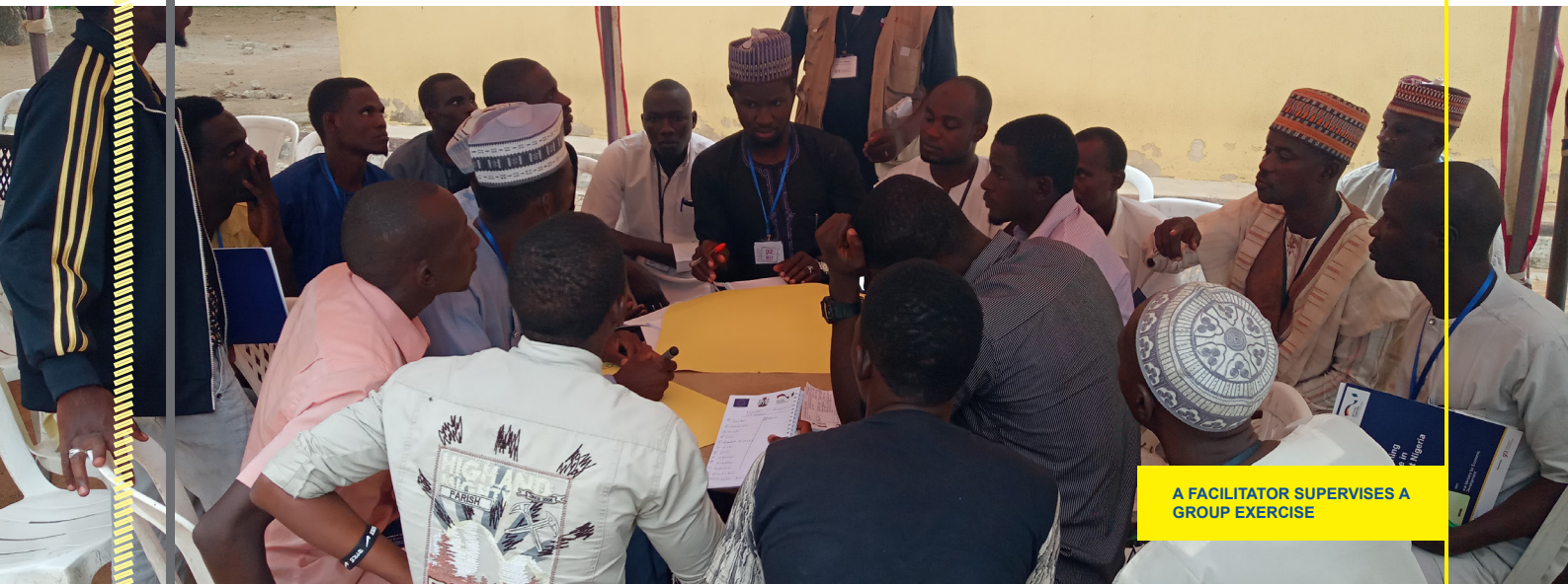
A FACILITATOR SUPERVISES A GROUP EXERCISE