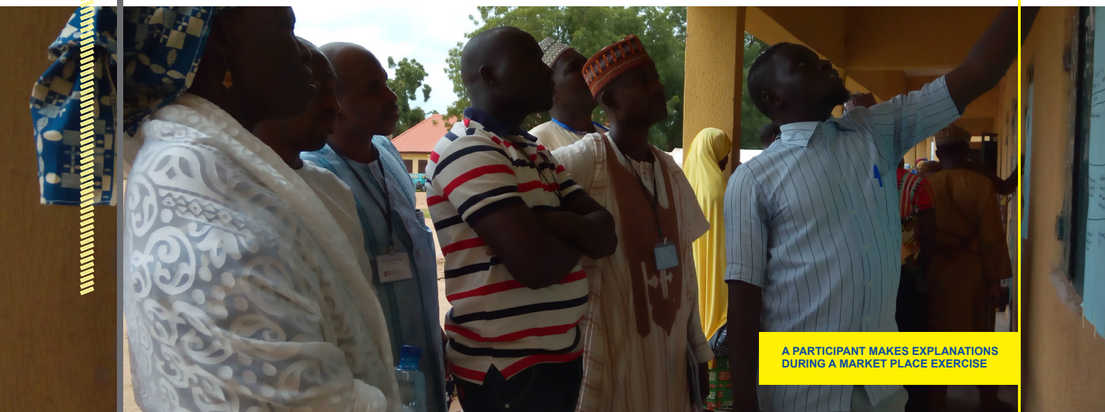
A PARTICIPANT MAKES EXPLANATIONS DURING A MARKET PLACE EXERCISE