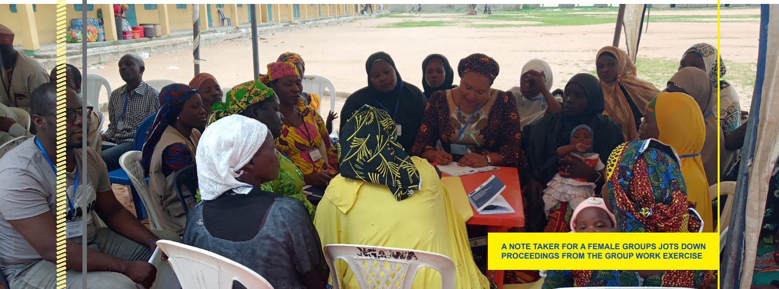
A NOTE TAKER FOR A FEMALE GROUPS JOTS DOWN PROCEEDINGS FROM THE GROUP WORK EXERCISE