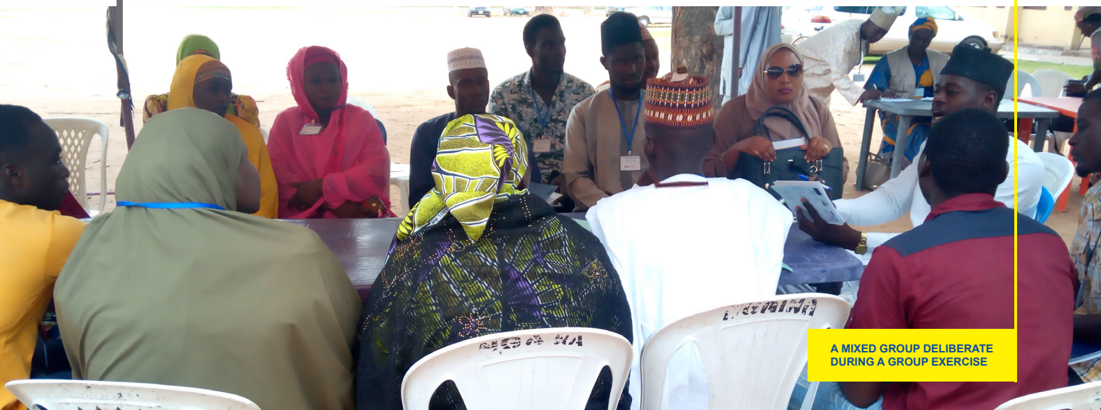
A MIXED GROUP DELIBERATE DURING A GROUP EXERCISE