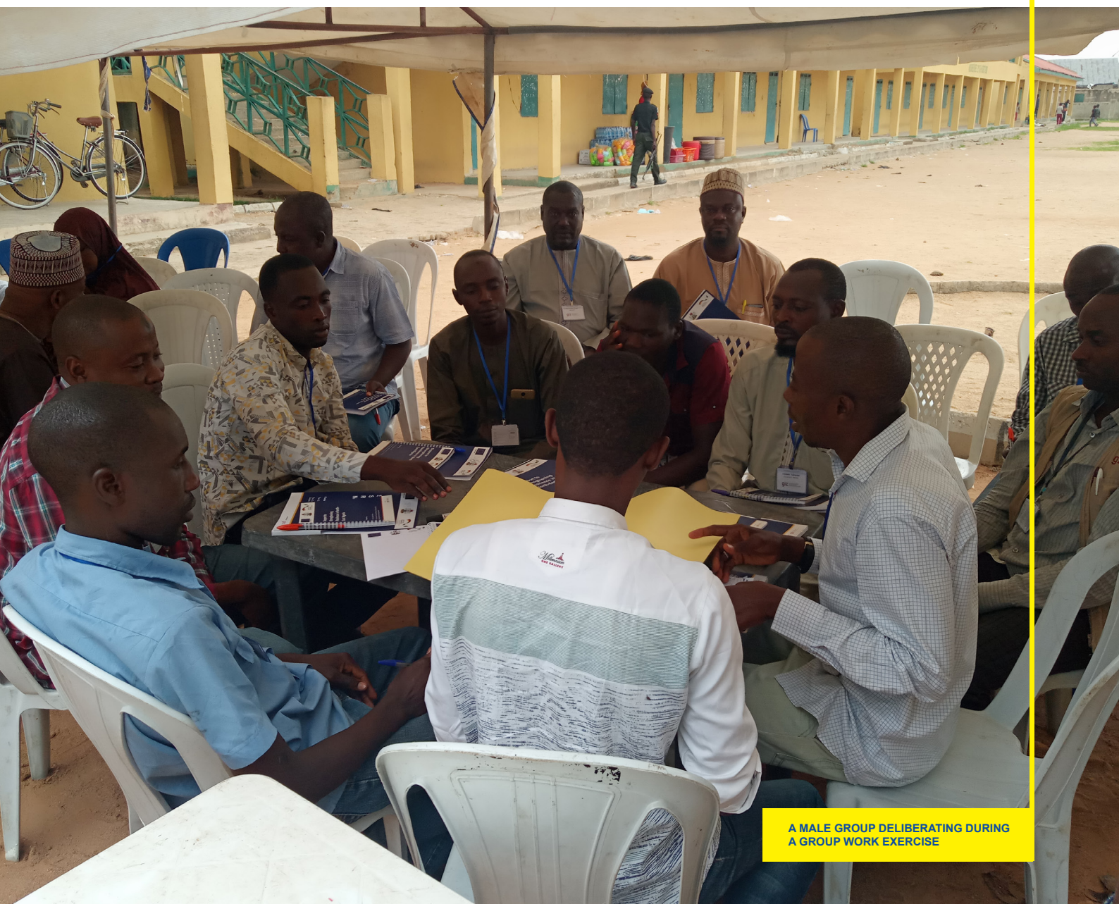
A MALE GROUP DELIBERATING DURING A GROUP WORK EXERCISE