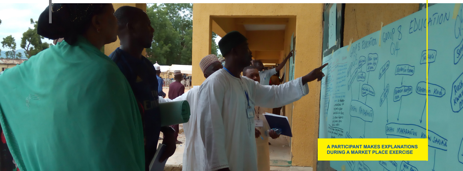
A PARTICIPANT MAKES EXPLANATIONS DURING A MARKET PLACE EXERCISE