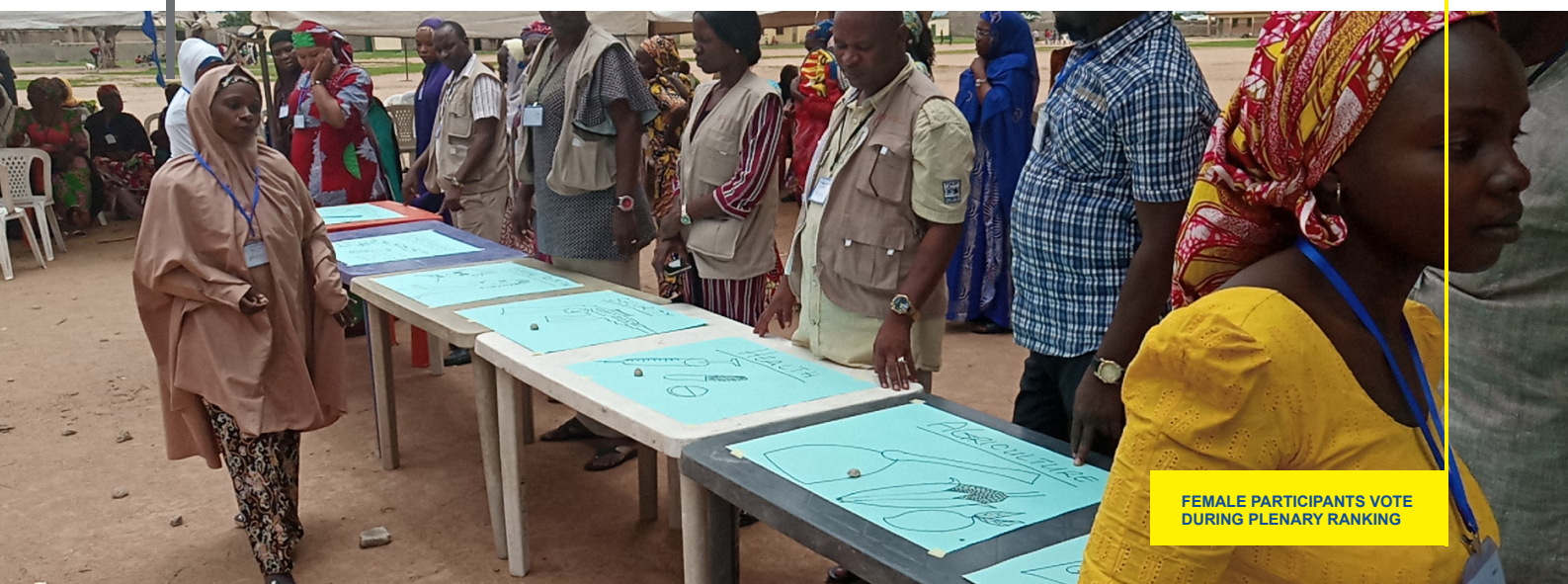
FEMALE PARTICIPANTS VOTE DURING PLENARY RANKING