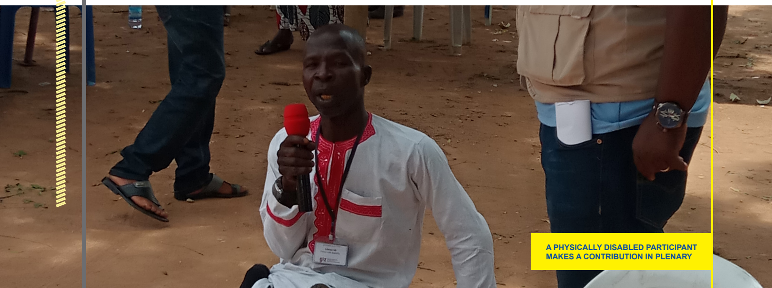
A PHYSICALLY DISABLED PARTICIPANT MAKES A CONTRIBUTION IN PLENARY