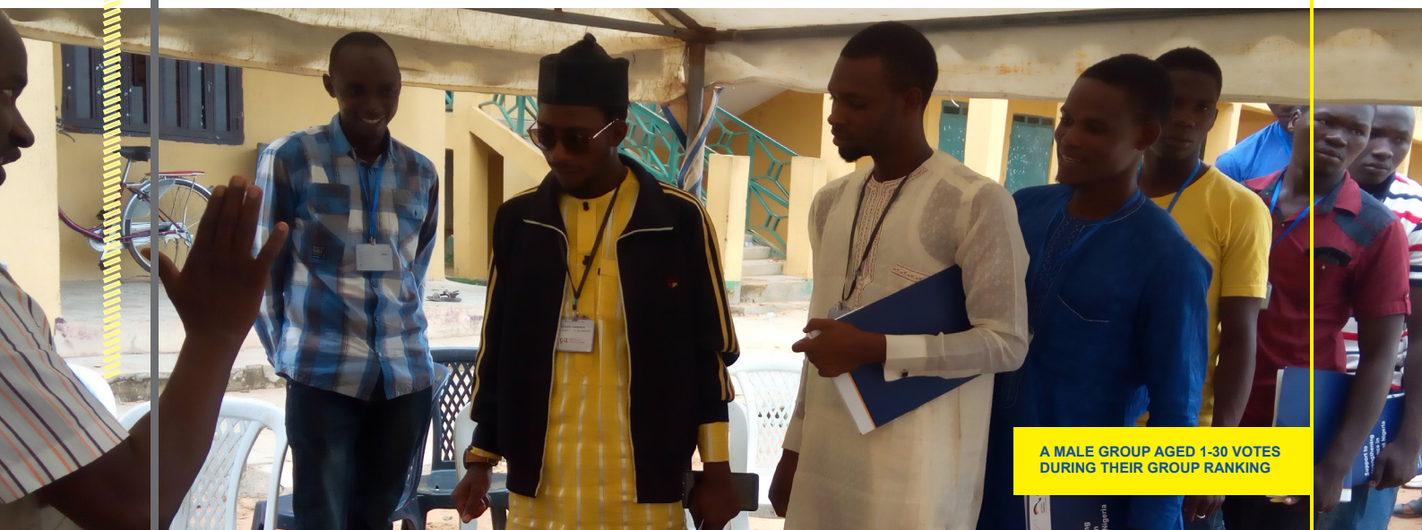
A MALE GROUP AGED 1-30 VOTES DURING THEIR GROUP RANKING