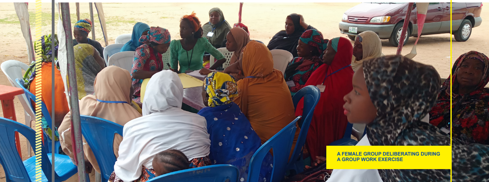
A FEMALE GROUP DELIBERATING DURING A GROUP WORK EXERCISE