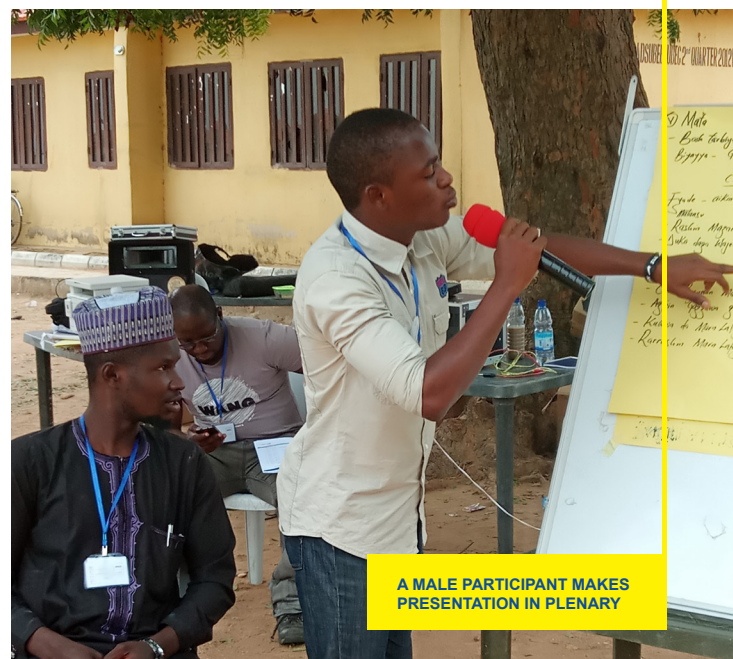
A MALE PARTICIPANT MAKES PRESENTATION IN PLENARY

The CDP process has provided the opportunity for community stakeholders to come together under one umbrella to discuss and analyze their livelihoods, problems, causes, strategies and potentials solutions. It is a process where members of a community are active participants in their problem identification, analysis of developmental issues affecting them and brainstorming on solutions to solve the problems. This is done while putting the peculiarity of their communities at the center of all the efforts. While stakeholder sensitization, ward analysis and community mobilization played a crucial role in the CDP process, the Community Development Planning Session itself is the heart of the process. This 4-day session is akin to the village/town meetings where members of the community come together to discuss issues that affect their development and plan activities to overcome those development gaps. The major objectives of the CDP sessions are: